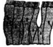
(a) ..... (b) ..... (c) .....